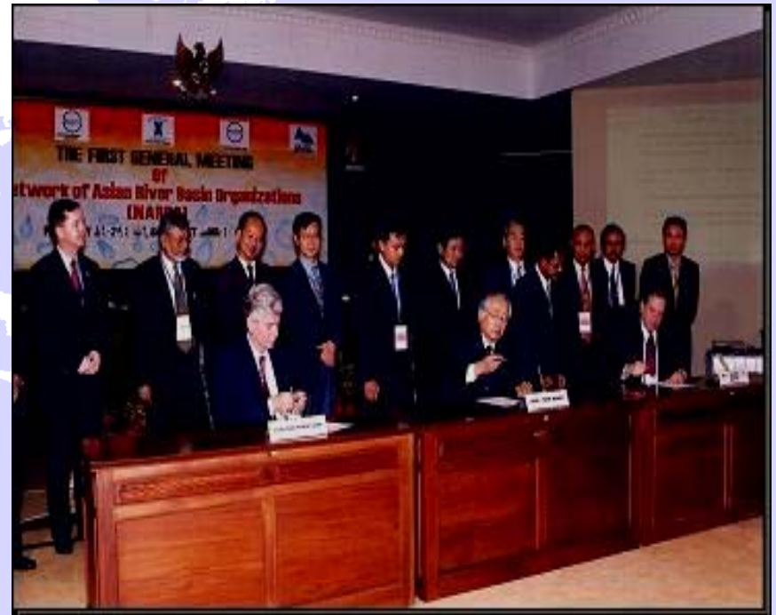
Signing LOI of NARBO Establishment (The 3rd World Water Forum, 2003)